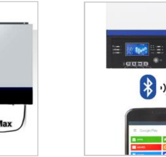
MOBILE MONITORING VIA BLUETOOTH